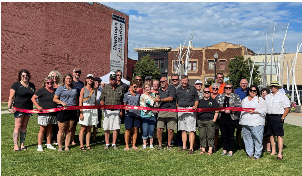
Hansen Arts Park Ribbon Cutting