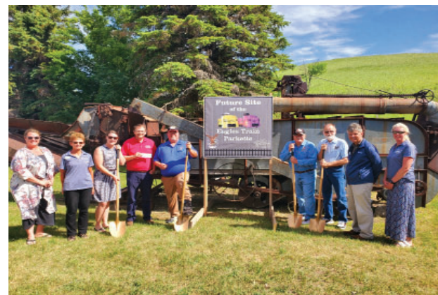
Eagles Train Parkette Ground Breaking